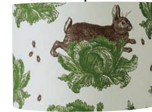
Rabbit and cabbage lampshade, £95, Thornback & Peel (thornbackandpeel.co.uk)