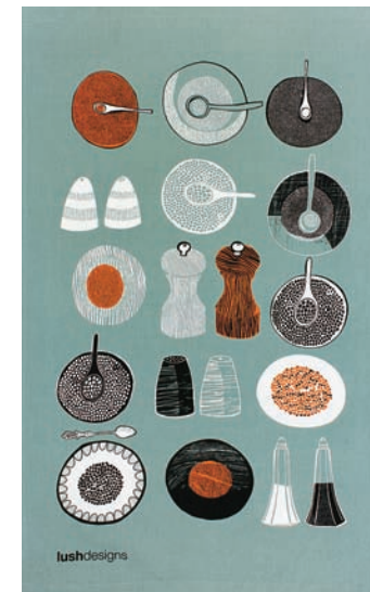
Salt and Pepper tea towel, £11, To Dry For (todryfor.com)