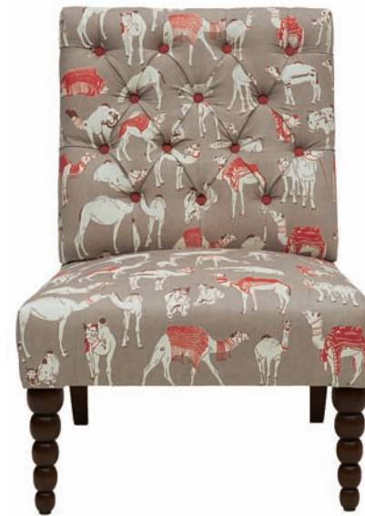
Dalhousie chair in Safomasi Pushkar Camels, £679, Iqrup + Ritz (iqrupandritz.co.uk)