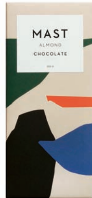
Almond butter chocolate, £6.50 for 70g, Mast Brothers (mastbrothers.co.uk)