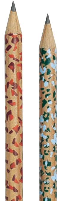
Printed pencils, £2 each, Hay at Liberty (libertylondon.com)