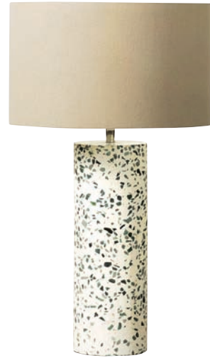
Terrazzo table lamp, £85, Oliver Bonas (oliverbonas.com)