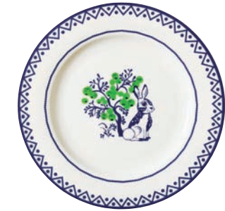
Apple Tree dinner plate, £19.50, Louise Wilkinson (louisewilkinson.co.uk)