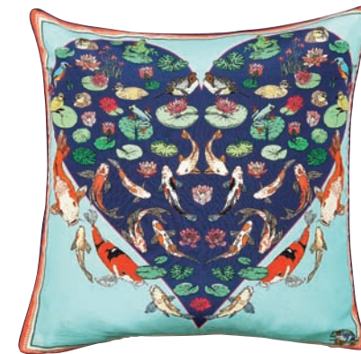
Koi carp cushion, £95, Silken Favours (silkenfavours.com)