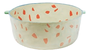
Grand Plat terrazzo dish, £55, Camille et Clémentine (camilleetclémentine.fr)