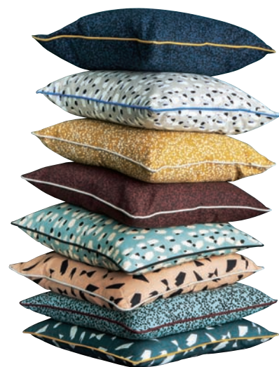
Terrazzo, Mini Cut and Spotted cushions, £45 each, Ferm Living (fermliving.com)