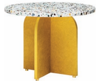
Terrazzo coffee table, £747, Crowdy House (crowdyhouse.com)

Marmorial tiles, from £325 + VAT per sq m, Max Lamb for Dzek (dzekdzkdzek.com)